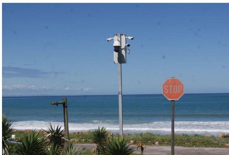
Figure 2 Typical CCTV pole