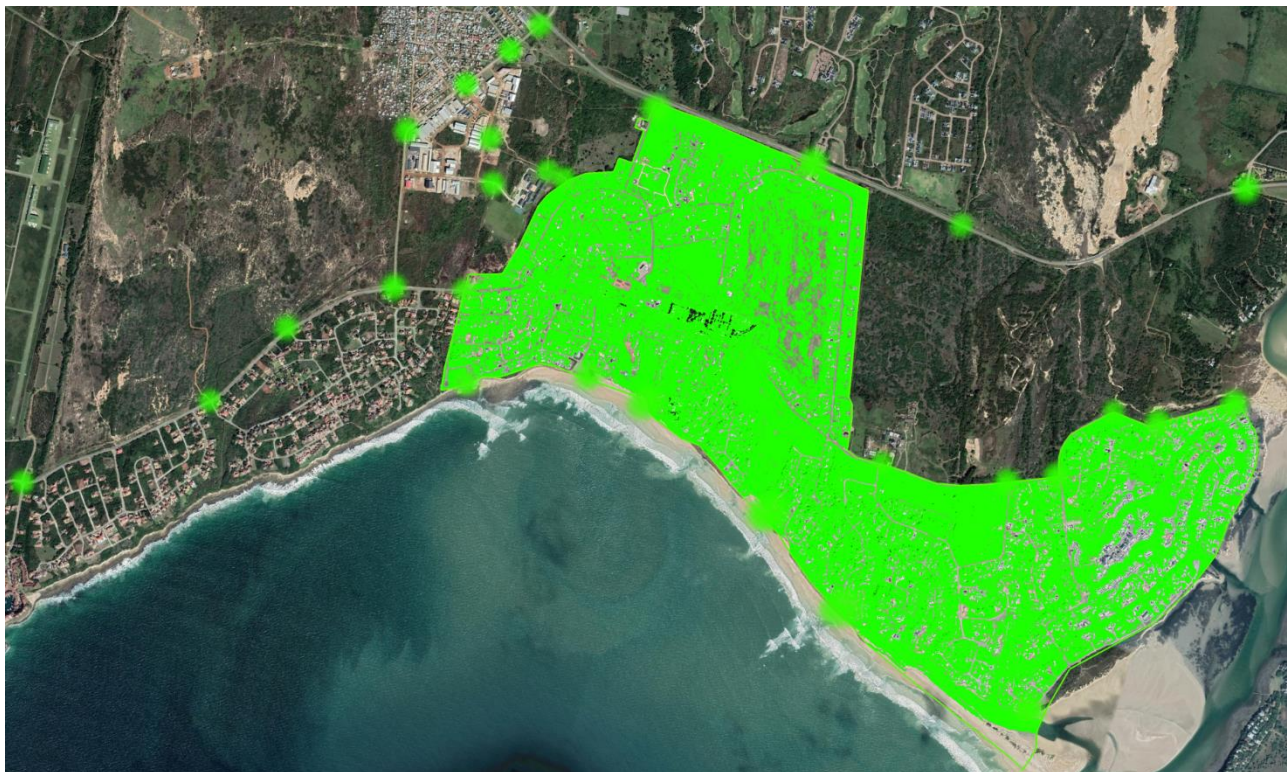
FIGURE 1 CCTV COVERAGE MAP

have purchased additional cameras. We have 9 streets/areas also wanting to install more cameras, but we had no choice but to delay these requests until we were certain of the future collection of the SRA levy to continue funding the CCTV infrastructure and monitoring service.